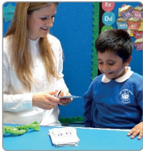
Learning the Speed Sounds in the classroom.