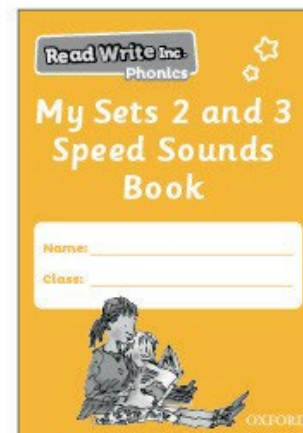
Practise reading and writing sounds in My Sets 2 and 3 Speed Sounds Book .

Ask your child to flick through the book and read the sounds as quickly as he or she can. If your child hesitates reading a sound, the picture is on the back as a reminder. Your child can also practise writing the sound on the same page.